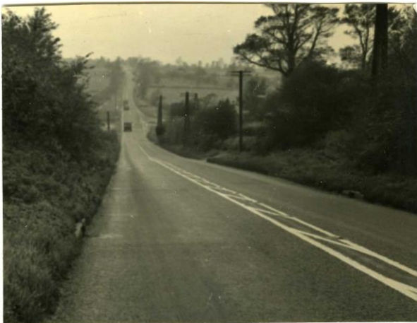
A5 Watling Street