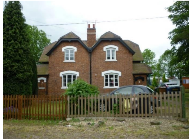
Tied Cottages, Smockington