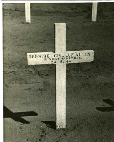
Beachy Head War Cemetery Anzio